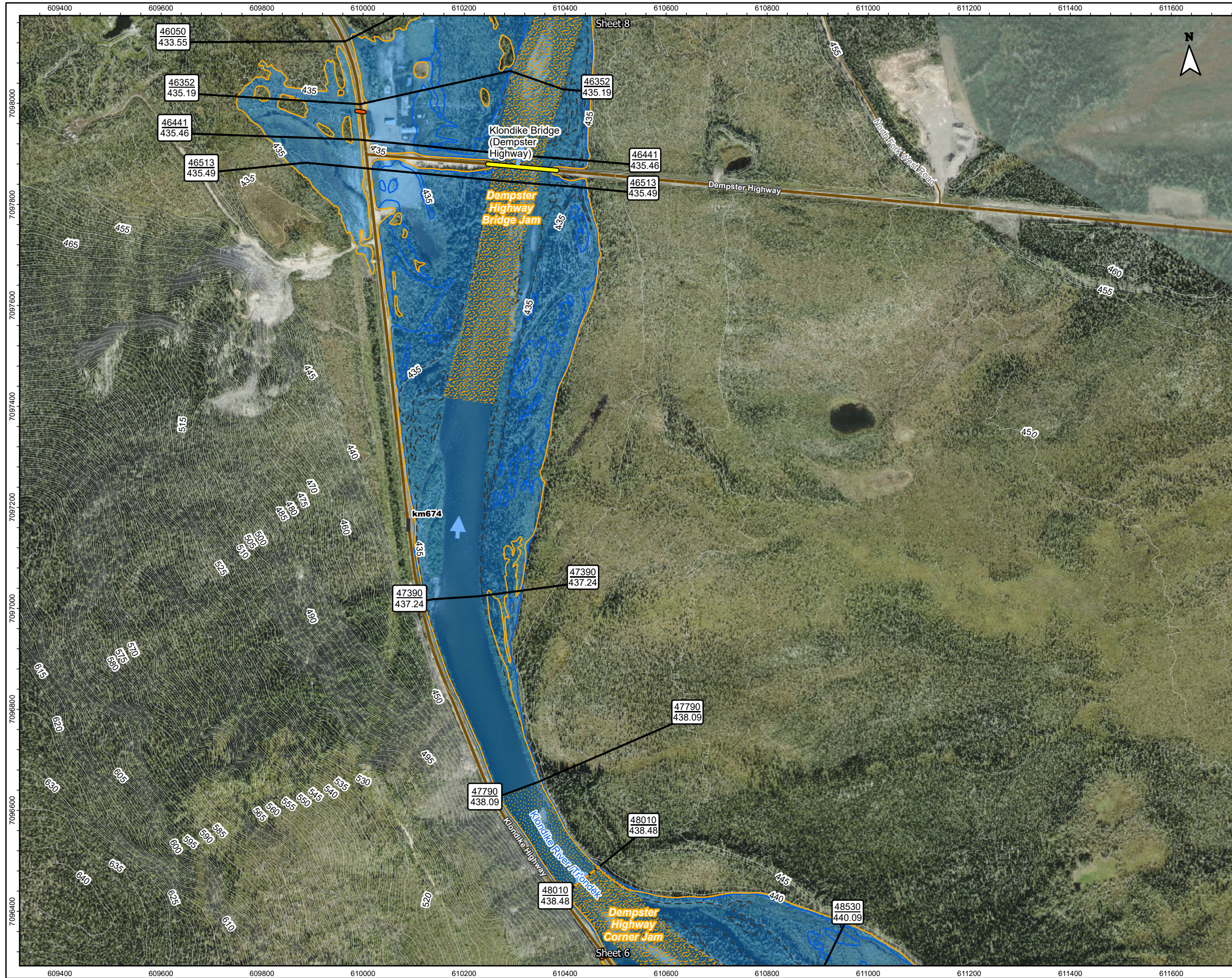
Figure No. KR-1-07 Sheet 07 of 41

Title: Dawson City and Klondike Valley Flood Mapping Study Composite Flood Hazard Map - Klondike River 1% Annual Exceedance Probability (AEP)