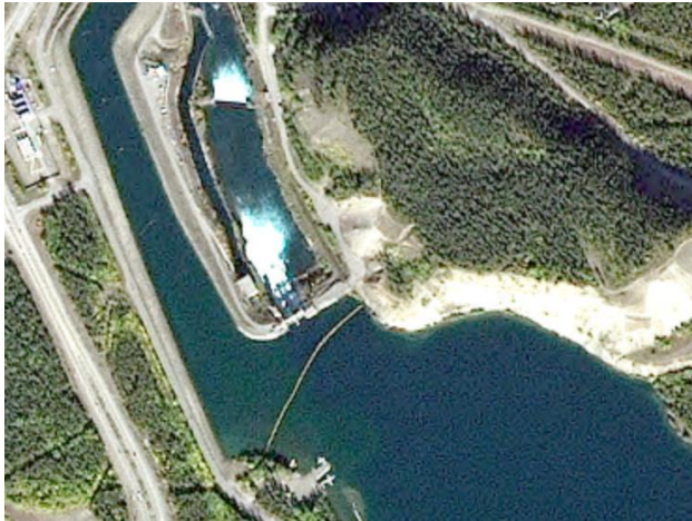
Government of Yukon