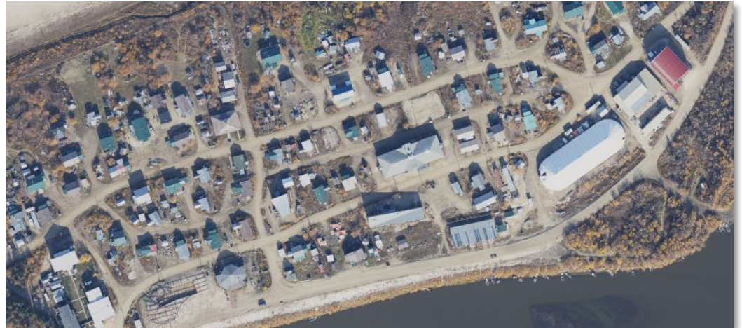
GeoYukon: Printing custom maps